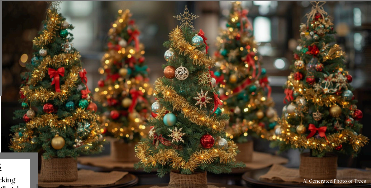
AI Generated Photo of Trees