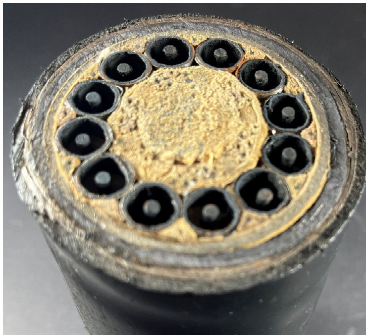
A cross section of the cable was recently donated to the museum by Raymond Thieme. The cable was buried across the Thieme land in southeast Nemaha county.#

Twenty-four underground power facilities, each with giant diesel generators capable of producing enough power to sustain the system, are nearing completion. Those too are underground and encased in heavy concrete.